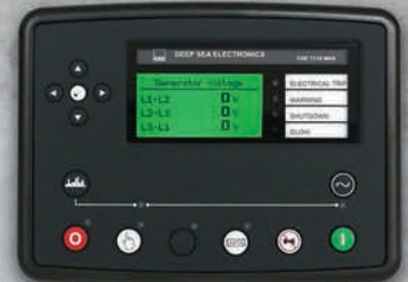
1 | DSEgenset® Digital Control Panel Model 7310 MKII