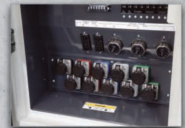
2 | Single-Phase Receptacles 120V - 20A x 2 -| 240V - 50A x 3 Optional Dual Row Cam-Loks™ Shown