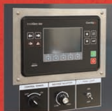
Parallelling Control Panel