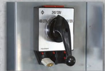
7 | Lockable Voltage Selector Switch 3Φ 277/480V & 139/240V-120/208V 1Φ 120/240V