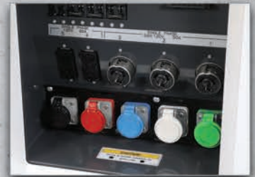
2 | Single-Phase Receptacles 120V - 20A x 2 | 240V - 50A x 3 Optional Single Row Cam-Loks™ Shown