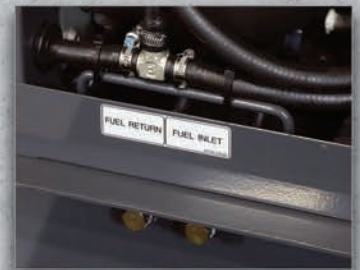
10 | External Fuel Tank Connections with 3-Way Selection Valve

BEST-IN-CLASS dBA RATING // 24-HOUR RUNTIME // EXCELLENT MOTOR STARTING THE INDUSTRY'S HIGHEST-QUALITY MOBILE GENERATORS