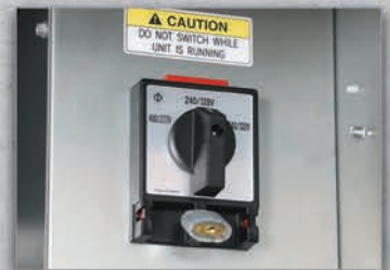
7 | Lockable Voltage Selector Switch 3Φ 277/480V & 139/240V-120/208V 1Φ 120/240V