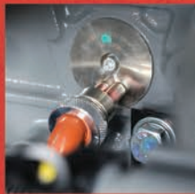
Engine Block Heater